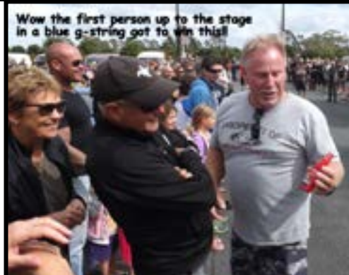
Wow the first person up to the stage in a blue g-string got to win this!