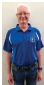
Club shirt – Flash polo mens and ladies