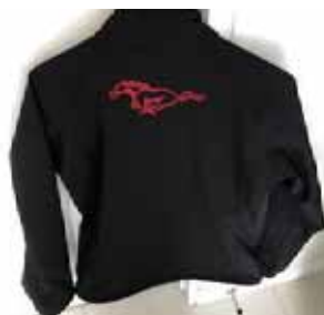
Black soft shell jacket front and back